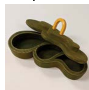
Green Cloud box with Golden Arch, Wooden reliquary box shaped as a butterfly by Anneloes van Beek

To learn more about the residency program, including information about the projects of past residents, visit www.moabarts.org/residency . Follow Moab Arts on social media (@moabarts