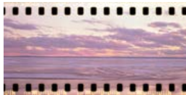
Kodak film strip photo of Nipissing Lake

use more sustainable processes. Cole will host a series of workshops and a closing reception, all free and open to the public. All four workshops revolve around creating and developing images with eco-friendly and organic film processes that use coffee grounds, baking soda and vitamin C. Workshop participants will learn how to build cameras and develop film using materials from the waste stream and thrift store. The images and film created through the workshops, along with the work that Cole has created throughout the month-long artist residency, will be presented at the end of the residency.