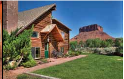
CASTLE VALLEY RANCH MLS 1461208 $795,000