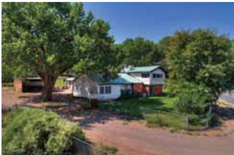
RARE DESERT OASIS MLS 1475356 $550,000