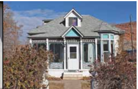
HISTORIC MOAB MLS 1498416 $375,000