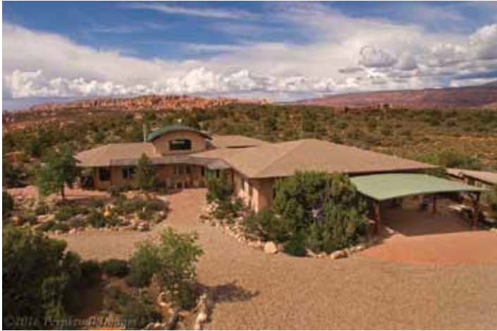
360 DEGREE VIEWS MLS 1377302 Offered at $1,395,000