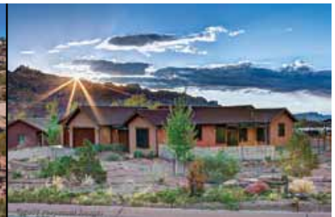
WELCOME HOME MLS 1441997 $570,000