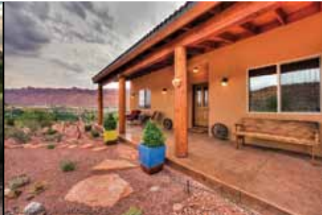
RED ROCK PANORAMAS MLS 1450760 $685,000