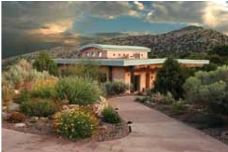
ECOLOGICAL SANCTUARY MLS 1325867 $846,000