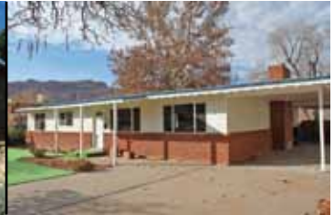
YOUR HOME IS HERE MLS 1496614 $295,000

YOUR ISLAND IN THE SKY 3.23 acre Kayenta Heights 1260380 $189,900 BEAUTIFUL BUENA VISTA .60 acre close to downtown 1485380 $129,000 MOUNTAIN VALLEY LIVING 3.98 ac prime lot in La Sal 1488679 $40,000 EXTREME VIEWS 2.6 acre Kayenta Hts, dramatic views 1399391 $170,000