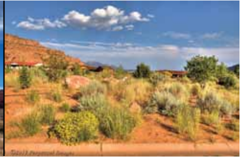
WHITE HORSE SUBDIVISION Custom Homesites from $134,000