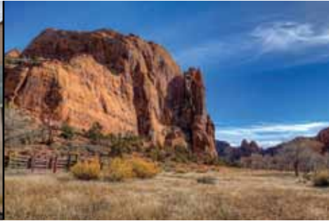
YOUR MILLCREEK CANYON MLS 1434478 Offered at $1,995,000