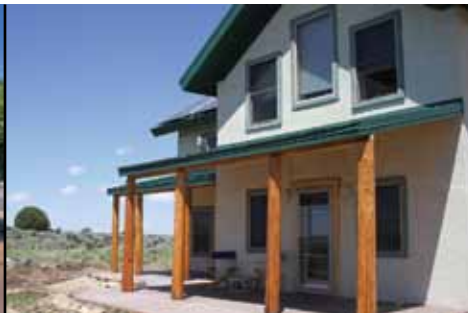
PRIVACY & VIEWS MLS 1386941 $284,000 Monticello