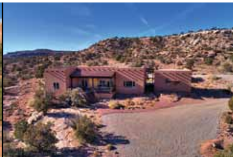
HIGH DESERT PERFECTION MLS 1497362 $695,000