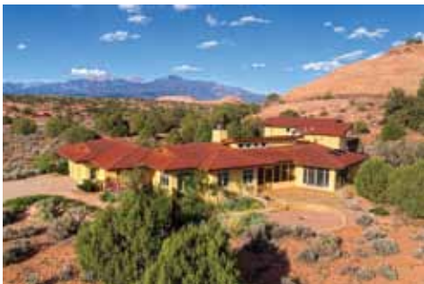
STUNNING LOCATION MLS 1463584 $795,000