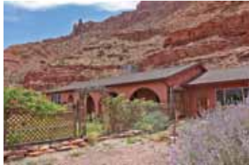
RED ROCK RETREAT MLS 1454717 $399,900