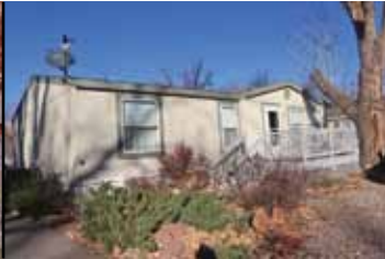
CHARMING START MLS 1496716 $76,000