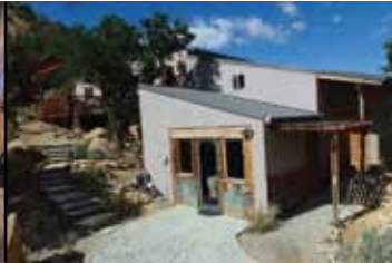
UNIQUE RETREAT MLS 1436947 $349,000