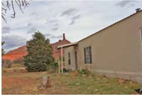
SIMPLE COUNTRY LIVING MLS 1492668 $285,000