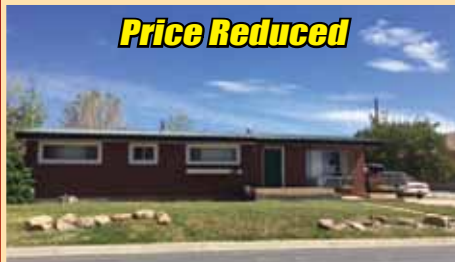
REMODELED cute 3B/1B home on corner lot near high school on .28 of an acre. 2 storage sheds. Many upgrades since current owner has owned this property. Contact agent for complete list of upgrades. $122,900. #1454617 (Monticello) Call Kristie (Owner/Agent)