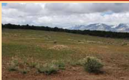
7 MILES N of Monticello awaits this peaceful retreat with views in every direction. Incredible 12.79 acres for you to build your dream home. $65,000. #1452447 Call Janaea