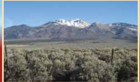
3 GREAT LOTS at the base of the La Sal Mountains in La Sal. Close to fishing, camping & most outdoor recreation activities. NO CC&R's. $33,000 to $45,900. #1482122, 23, 26 Call Randy