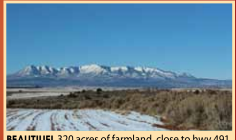
BEAUTIFUL 320 acres of farmland, close to hwy 491. Access of county road 338 west of Eastland Rd. Lease on a year to year basis. Additional details provided to interested parties. $160,000. #1500988 (Monticello) Call David