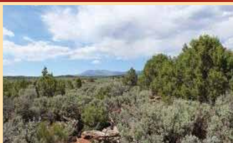
2 LOTS near Recapture Reservoir near Blanding with the space that comes with county living. Well on each property. $75,110. each #1454777 & #1454778 Call David