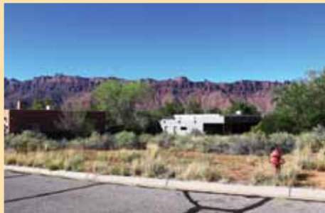
PERFECT LOT NEAR MOAB GOLF COURSE! .23 acre with utilities stubbed to the lot. Ready to build in a great location. $110,000. #1480317 Call Randy