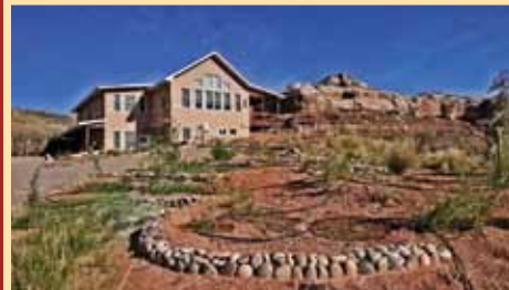
A BEAUTY IN BLUFF! 4836 sq.ft., 3B/2B home in incredible location. Includes 2.45 acres, carefully selected high quality materials, hardware, fixtures & finishes. This is a MUST SEE! $699,500. #1455991 (Bluff) Call Janaea or David