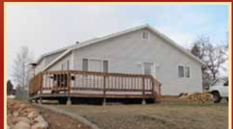
CHARMING & UNIQUE 4B/2B 2,949 sq.ft. home w/ wrap around deck & fire pit for entertaining friends or simply gazing at the stars on a cool summer evening. Professionally landscaped with lush lawns & raised garden area. $174,000. #1432656 (Monticello) Call Janaea