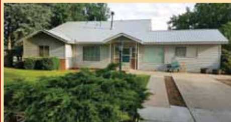
NEVER FEEL CRAMPED in this 5B/3B home with lots of room to move. You'll love the free flowing design, easy-care kitchen & large fenced in yard with lots of mature fruit trees. A home you'll want to stay in forever. $189,000. #1454475 (Blanding) Call Janaea