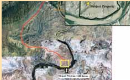
FANTASTIC OPPORTUNITY if you want to be or are in the gravel business. 140.59 acres of pave grade gravel along the Green River. $969,000. #1479686 Call Randy