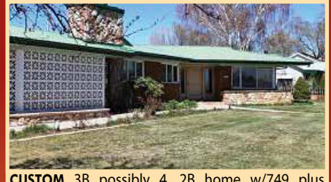
CUSTOM 3B possibly 4, 2B home w/749 plus square foot basement great for storage. Amazing master suite, large windows offering lots of natural lighting. Private patio, large backyard & planters complete with water feature. $295,000. #1454564 (Monticello) Call Kristie