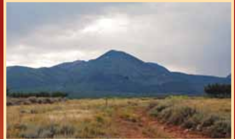
BEAUTIFUL 23.61 acres next to National Forest. No CC&R's. Peaceful setting at base of the La Sal Mtn's. Established oak brush & rolling terrain. $149,500. #1478326 Call Sue