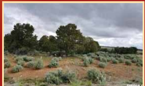
16.4 ACRES with amazing 360° views near Monticello. Well, gravel driveway & pad for future shop in place. Great location for your dream home. $98,000 #1452446 Call Janaea