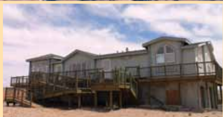
MAJESTIC views from top of the bluff. Breath taking views from the wrap around deck of this 4B/3B home with open floor plan. Dirty Devil River is the S. boundary of this beautiful 251 acres with a privately owned slot canyon. $527,500. #1465144 (Hanksville) Call Kristie