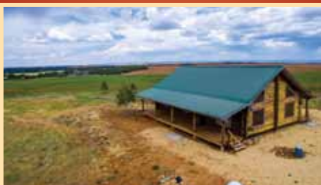
LOG HOME on 160 acres with views of 4 mountain ranges. This 1400 sq.ft. log home offers 2B/2B with very open floorplan with huge loft. Huge barn & 4 car shed for all your toys. Located on the end of the lane. $699,000. #1434697 (Eastland) Call Randy