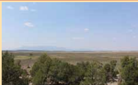
GREAT PROPERTY! 320 acres near Monticello with lots of potential uses from building your off grid home to growing wheat or raising livestock. $200,000. #1476841 Call David