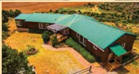
38 ACRES of fantastic property! 2200 sq.ft. 2B/2B home with open kitchen & huge windows to enjoy the views of the Abajos & Blue Mountains. Also offers work out studio for yoga, weights or whatever your desire. MUST SEE! $375,000. #1462175 (Eastland) Call Randy