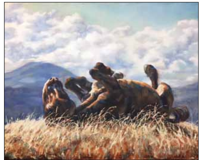
These Rolling Hills by Randall May

Randall’s paintings and sculptures range from small to monumental in size and are collected both nationally and internationally, some for permanent collections. He has placed monumental sculpture in many private and public