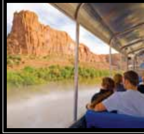
Daytime Jet Boat Tours » 1 or 3 hours