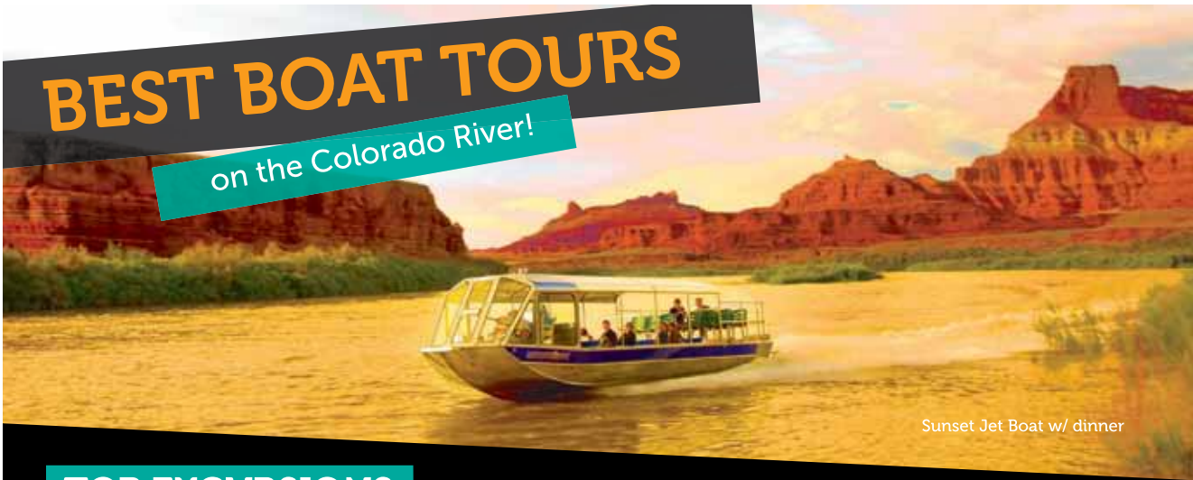
Sunset Jet Boat w/ dinner

Discover the beauty of Moab with a reputable tour company you can trust. Offering water, land and air tours of the entire Moab area with knowledgeable and experienced guides. Create unforgettable vacation memories with Canyonlands By Night & Day.