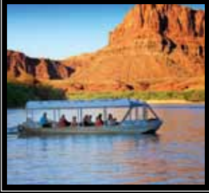
Sunset Jet Boat with Dinner