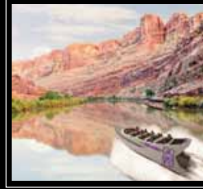
Spin & Splash Jet Boat » NEW!