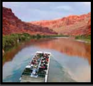
Sound & Light Show with Dinner